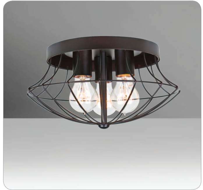
SPEZZA 13 CEILING SHOWN IN BRONZE (SPEZZA13C-BR) WITH EDISON LAMPS

UL or ETL Listed. Suitable for Damp Locations (interior use only).